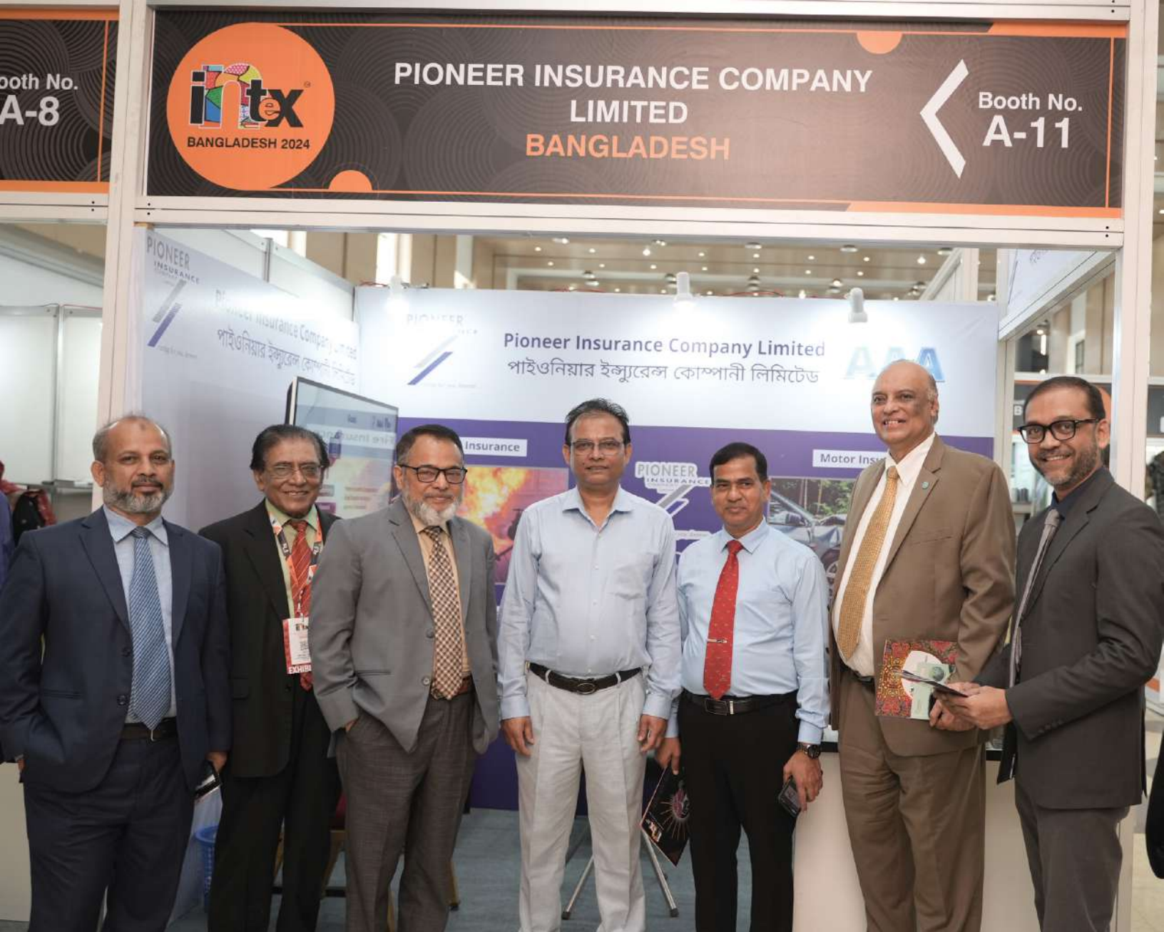
Honorable management and high officials of Pioneer Insurance Company Ltd in front of their booth, showcasing their presence.

KBCCI was proud to be invited as an Industry Partner for this prestigious event. The Chamber's participation allowed for a variety of networking opportunities, including interactions with international industry bodies, buyers, and industry leaders. This involvement facilitated important connections between KBCCI members and international stakeholders. Special packages were made available for KBCCI members to take part in the exhibition, offering further value through B2B meetings with domestic and overseas VIP buyers, as well as interactions with trade media representatives.