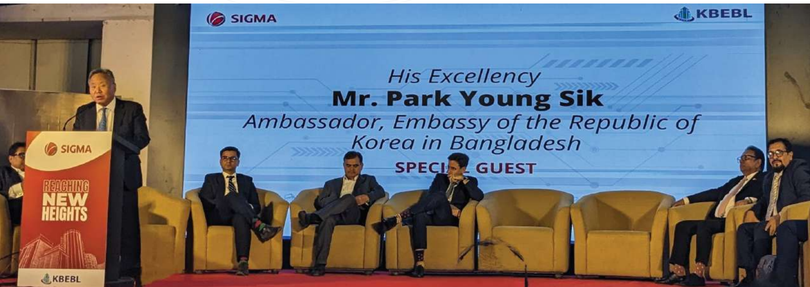
Honorable Ambassador addresses the event as the Special Guest.