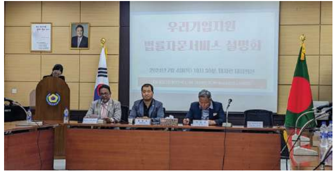
KBCCI President shares his views as the Special Guest of the seminar.