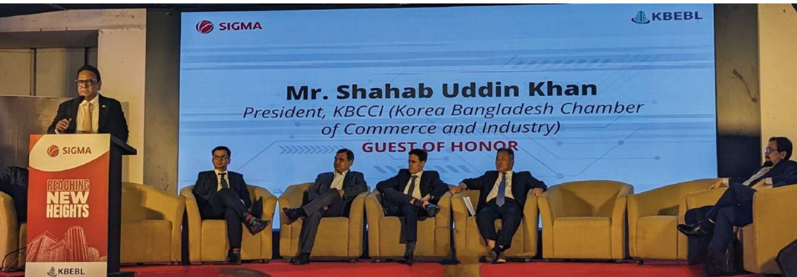
President of KBCCI addresses the event as the Guest of Honor.

The launching event mainly focused on the introduction of two new Sigma technologies in Bangladesh, ACRA 2.0 & SOLON 2.0, which underscored Sigma Elevator's commitment to excellence and innovation, reinforcing its position as a leader in the elevator industry.