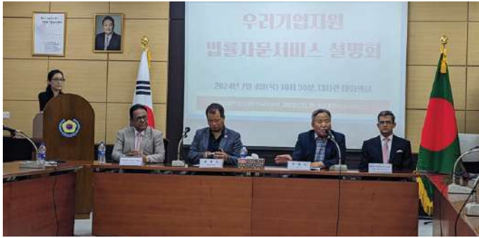
Honorable Ambassador shares his insights as the Chief Guest at the seminar.