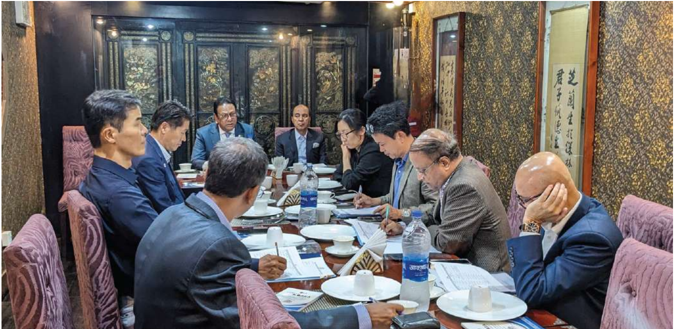
A moment of the meeting in progress, with all participants actively engaged.

Key discussions during the meeting focused on several significant initiatives: