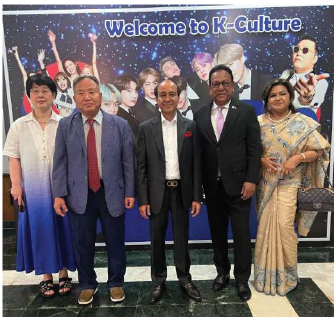
KBCCI President and Advisor with the Ambassador at His Residence.